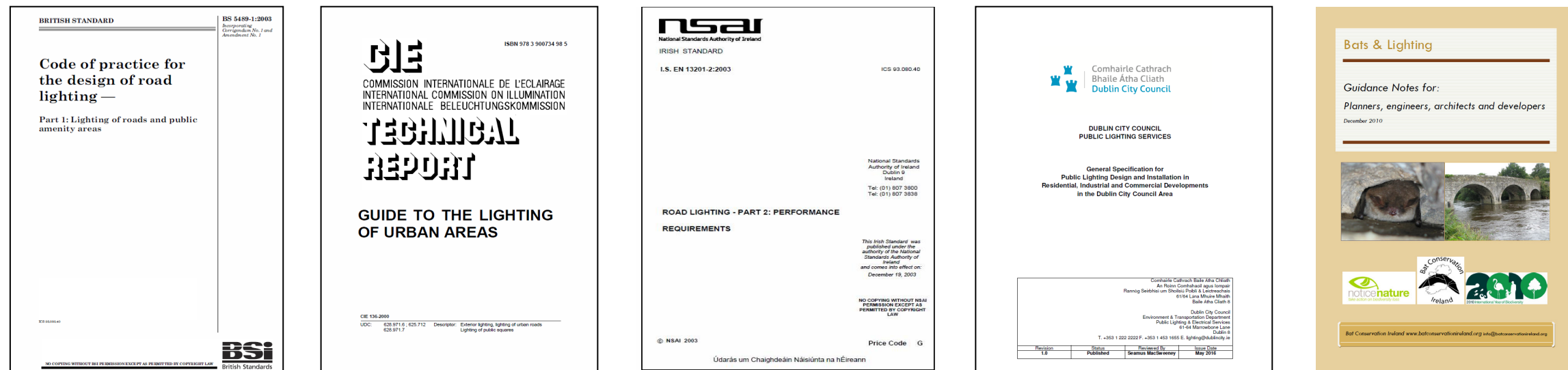
Figure 2.1 - Lighting Design Guides

The design criteria applied to the proposed external lighting installations is in accordance with BS 5489-1:2003 Code of practice for the design of road lighting 1 , CIE Guide to the Lighting of Urban Areas 2 , NSAI EN I.S. 13201-2 Road Lighting Performance Requirements 3 , General Specification for Public Lighting Design and Installation in Residential, Industrial and Commercial Developments in the Fingal County Council Area 4 . The guidelines in “Bats & Lighting, Guidance Notes for Planners, engineers, architects and developers”, issued by Bat Conservation Ireland were also taken into account in the design of lighting.